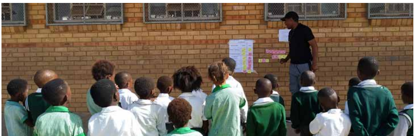
Learners attentively participating in exercises on GBV prevention.

The presentations will take the form of information banners, a video presentation and plenary discussions.